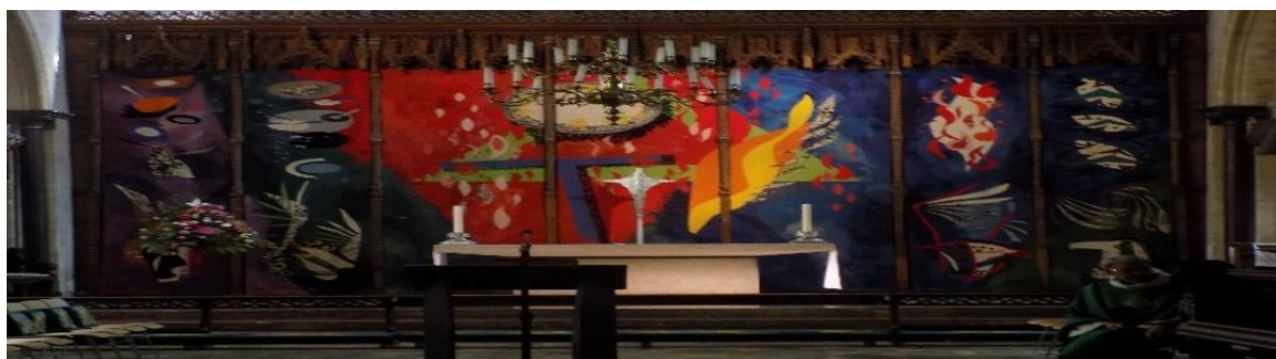
The Holy Trinity – Tapestry by John Piper, Chichester Cathedral

Sunday 1 st – 7 th Sunday of Easter – Eternal God, you have given all authority in heaven and on earth to your Son, our Saviour Jesus Christ. Grant that I may never lose the vision of your kingdom but serve you with hope and joy through him who lives and reigns with you, in the unity of the Holy Spirit, one God, now and forever. Amen (MSB 544)