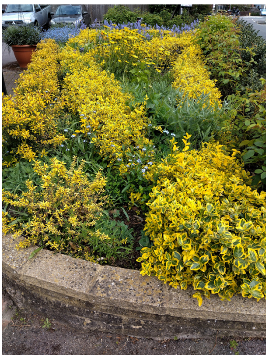
The garden at Trinity 23.4.24