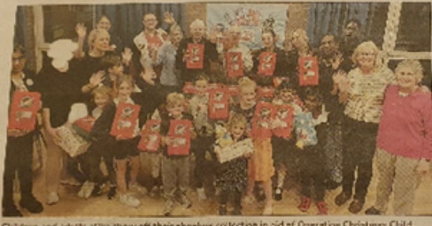
Children and adults alike show off their shoebox collection in aid of Operation Christmas Child.