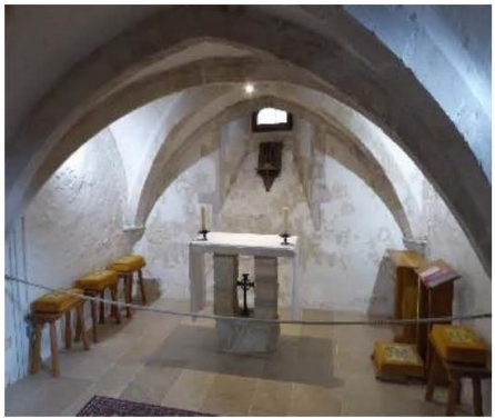
The Prayer Chapel in the Crypt of St Martins Parish Church Bosham, West Sussex

Members contribute as they feel led by the Holy Spirit; and total confidentiality is maintained. The session closes with a Prayer and the Grace.