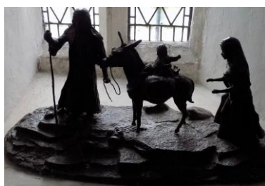
Escape to Egypt –Breamore Church, Hampshire

What faith and trust Joseph had! (From ‘The Message’ Matthew 1:18-25, 2:12-15)