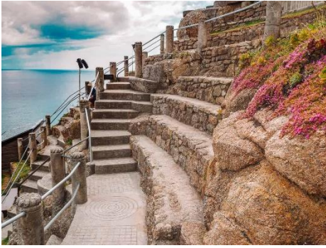
Minack Theatre, Cornwall