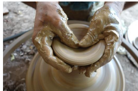
Hand made: Potter at Work (Rajesh) Open Verse

Monday 3 rd A prayer of self-examination: Have your own way Lord, have your own way; You are the Potter I am the clay. Mould me and make me, after your will, while I am waiting yielded and still. Have your own way Lord, have your own way; search me and try me, Master today. Whiter than snow, Lord wash me just now, as in your presence humbly I bow.