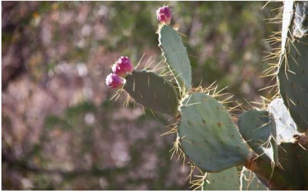
Cacti, ChrisGold OpenVerse

When in the desert I cry for relief, pleading for paths marked by certain belief, lift me to love you beyond sign and test, trusting your presence, my only true rest. (from StF 240vv1-2 Ruth C Duck)